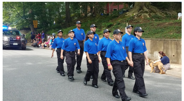
A group of the Police Explorers marching in a Takoma Park event

chance to help the community by putting what they have learned into practice by making sure everyone feels safe. Community service hours are offered either during classes or events. The Police Explorers program is a great way to gain self confidence and cultivate leadership skills. If you're interested, please contact the Takoma Park Police Department to learn more!