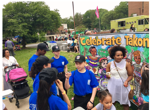
A group of the Police Explorers volunteering at Celebrate Takoma