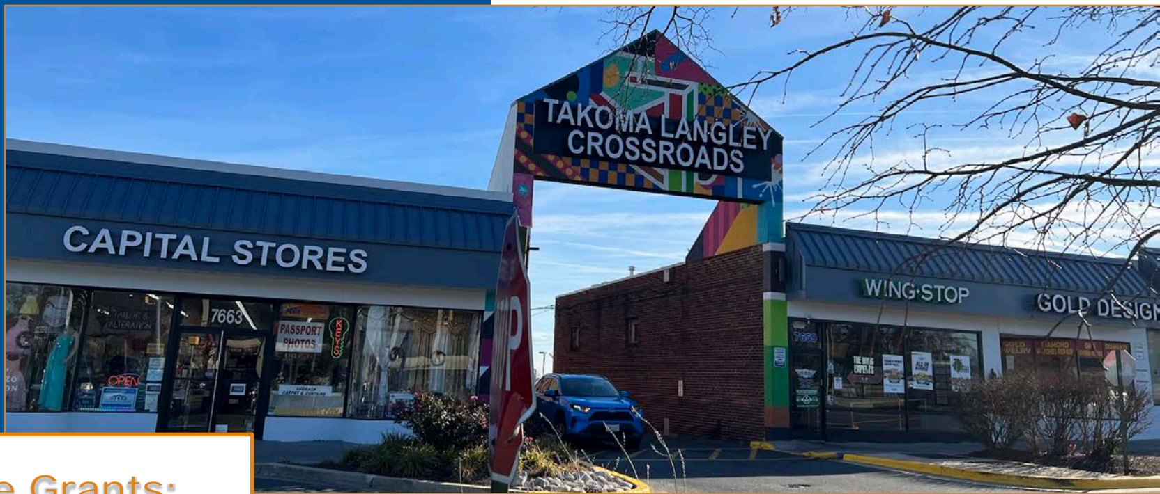
Façade Grants: Takoma-Langley Crossroads