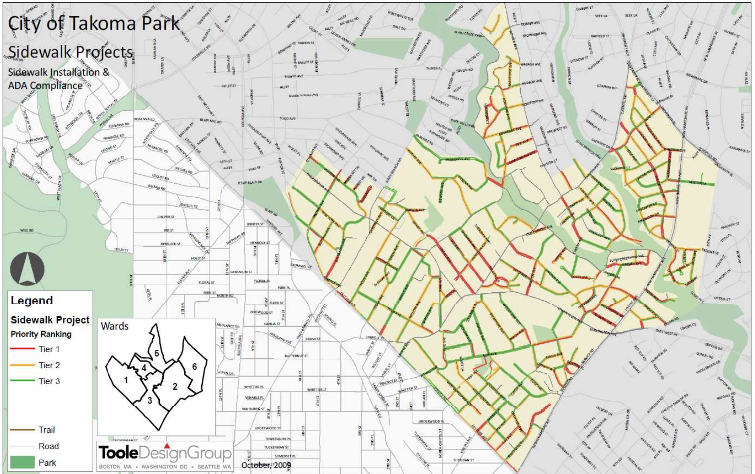
Figure 2 - 2009 Prioritization of Sidewalk Installation in the City