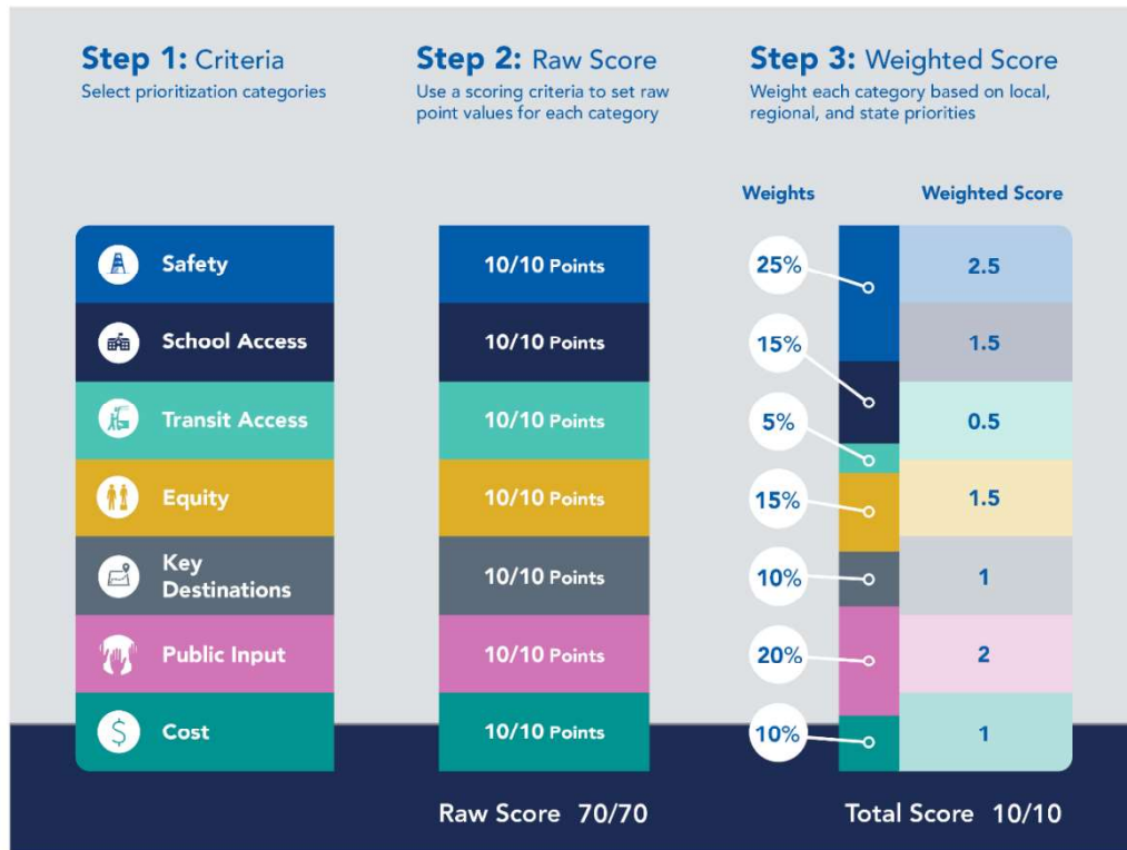
Figure 1 - Template for a Criteria-Scoring-Weighing Tool