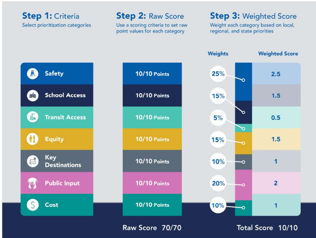
Figure 1 - Template for a Criteria-Scoring-Weighing Tool