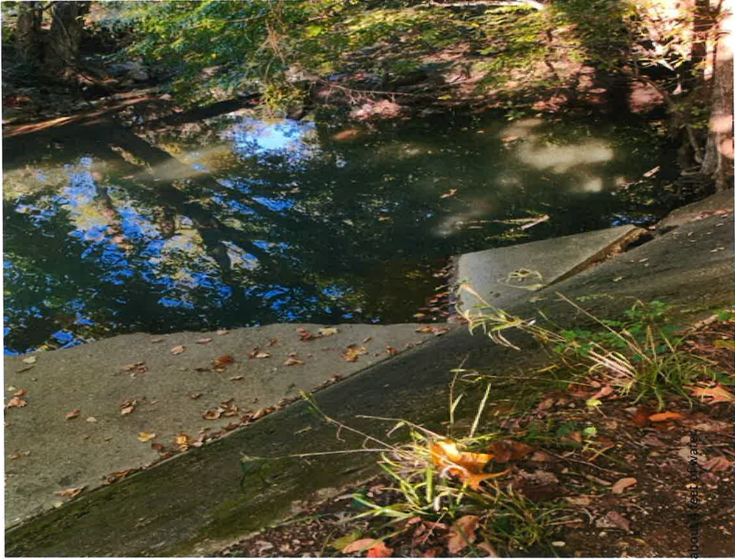
2. Apron Edge- about 4 feet of water