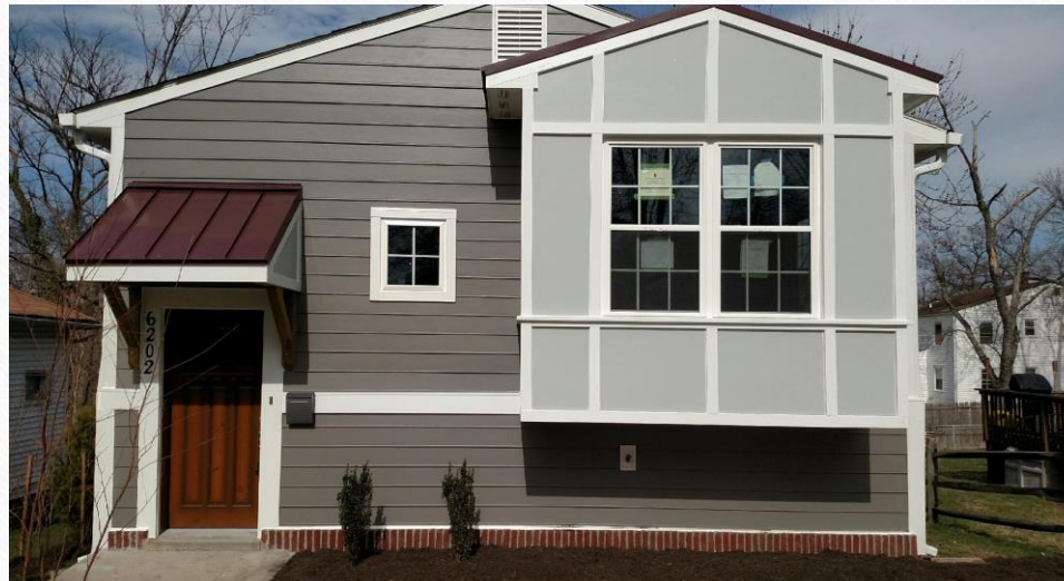
City of Takoma Park and HIP - 320 Lincoln Avenue Redevelopment