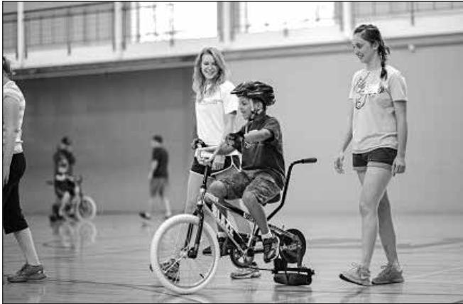
Everybody can bike at iCan Shine, a week-long summer camp.

ment of 20 inches and weigh no more than 220 pounds. Riders must wear their own bike helmet and must have an appropriate personal bike available for the iCan Bike program by no later than Thursday (Day Four) of the program. The goal is to transition all riders to their own bikes towards the latter part of the week. Two volunteer “spotters” are needed per rider. Spotters work with the same rider for each of the five days and experience the thrill of giving the gift of riding a bike! Volunteers must be at least 16 years old (unless accompanied by an adult); be able to attend 90 minutes at the same time each of the five days of camp (15 minutes of training/daily debriefing, 75 minute session); be able to provide physical, emotional and motivational support to the assigned rider and be able and willing to get some exercise (light jogging/running) for a great cause! This iCan Shine Bike Camp is free. Spaces are still available. To register for the camp or sign on to volunteer, contact Lucy Neher, lucyn@takom-aparkmd.gov .