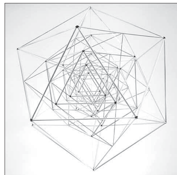
By Martin Levin

The Bridges Organization, which oversees the International Conference of Bridges, will display its two-dimensional and three-dimensional mathematical art,