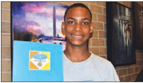
A Summer Youth Employment Program participant, ready to work.

using red and orange balls on a shortened court. For the more advanced and quick learners, we will progress to green/yellow balls and full court, improving groundstroke consistency/accuracy and working on serves/volleys.