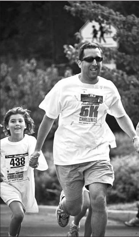
The Takoma Park Safe Routes for Kids 5K is popular among families.

ranging from $20 to $5,000. Top funders include Lusid Media, Finn Family Group, and Social and Scientific Systems, Inc. Money raised from the race supports the PTA at five schools in the City of Takoma Park: Piney Branch Elementary, Takoma Park Elementary, East Silver Spring Elementary, Rolling Terrace Elementary and Takoma Park Middle School. Schools find creative ways to use their funds, 50 percent of which are required to go towards pedestrian and bike education or health and fitness programming. For example, Piney Branch Elementary used proceeds to buy playground equipment and East Silver Spring Elementary now sponsors the popular “run club” which has more than 100 members. This family friendly race is open to all ages and abilities. Participants can run or walk a ¼ mile, mile or 5K (3.2 miles). For more information on how to participate visit: www.tkpk5k.com .