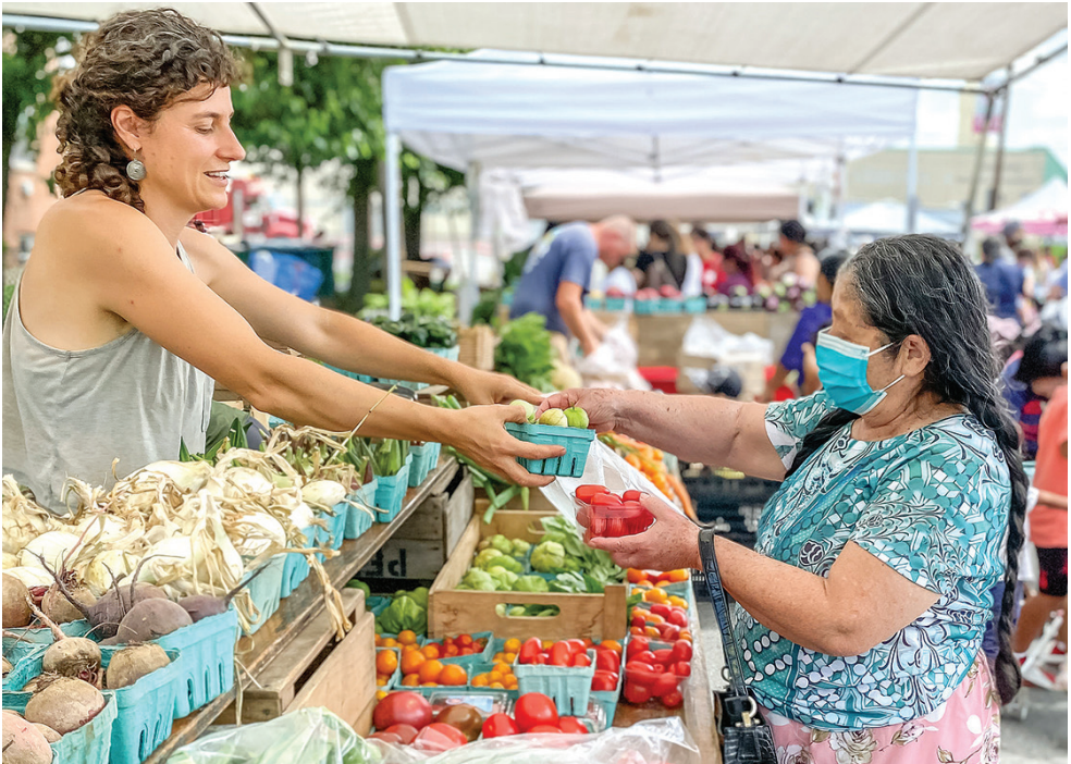
Crossroads will be holding a special Mother's Day event on May 10.

match up to $60 in SNAP funds, and WIC is $1-to-$1 without a limit. I think that the WIC sales make up about a third of total market sales, so it's pretty significant.” Servin says Crossroads is about much more than just the produce. The goal is to make it a social event for those looking for fresh produce, including hosting concerts and special events like health screenings, cooking demonstrations, and seed giveaways. “We do a lot of activities that bring in the community and get people coming back week after week,” says Servin. On May 10, Crossroads is holding special events for Mother's Day, including plant giveaways, raffles and special discounts for moms. For more on Takoma Park Farmers Market, visit takomaparkmarket.com . For information on Crossroads Farmers Market, visit crossroadscommunityfoodnetwork.org/farmers-market .