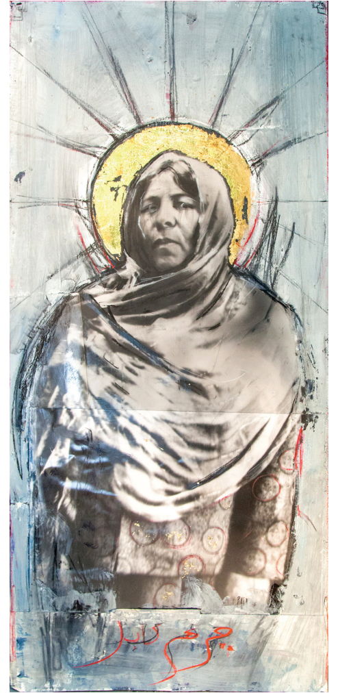
Above: Phantomscatalog by Landry Dunand